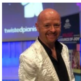
BGT STAR JON COURTENAY'S