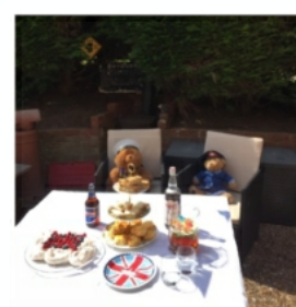
'VIRTUAL' VE DAY 75