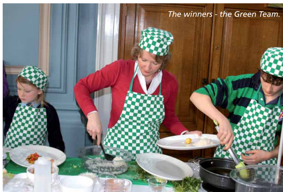
The winners - the Green Team.